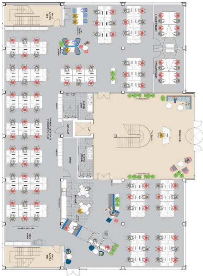
Example Ground Floor Layout