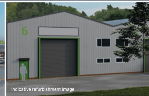
Indicative refurbishment image