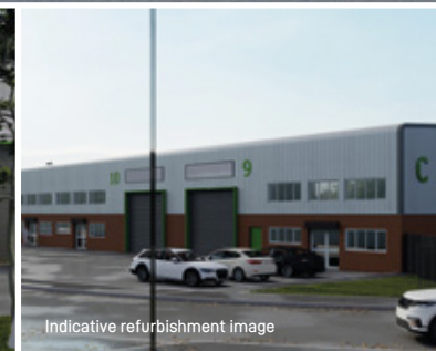
Indicative refurbishment image