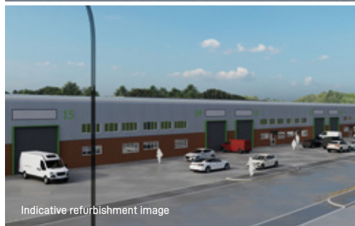
Indicative refurbishment image