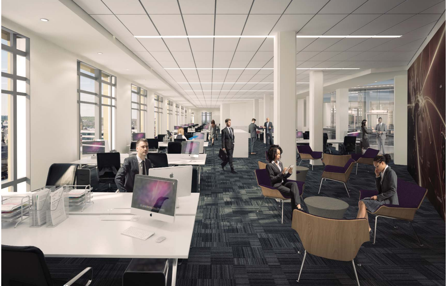
STEEL CITY HOUSE, SHEFFIELD

Fully refurbished Grade A Office building centrally located, close to the City Centre