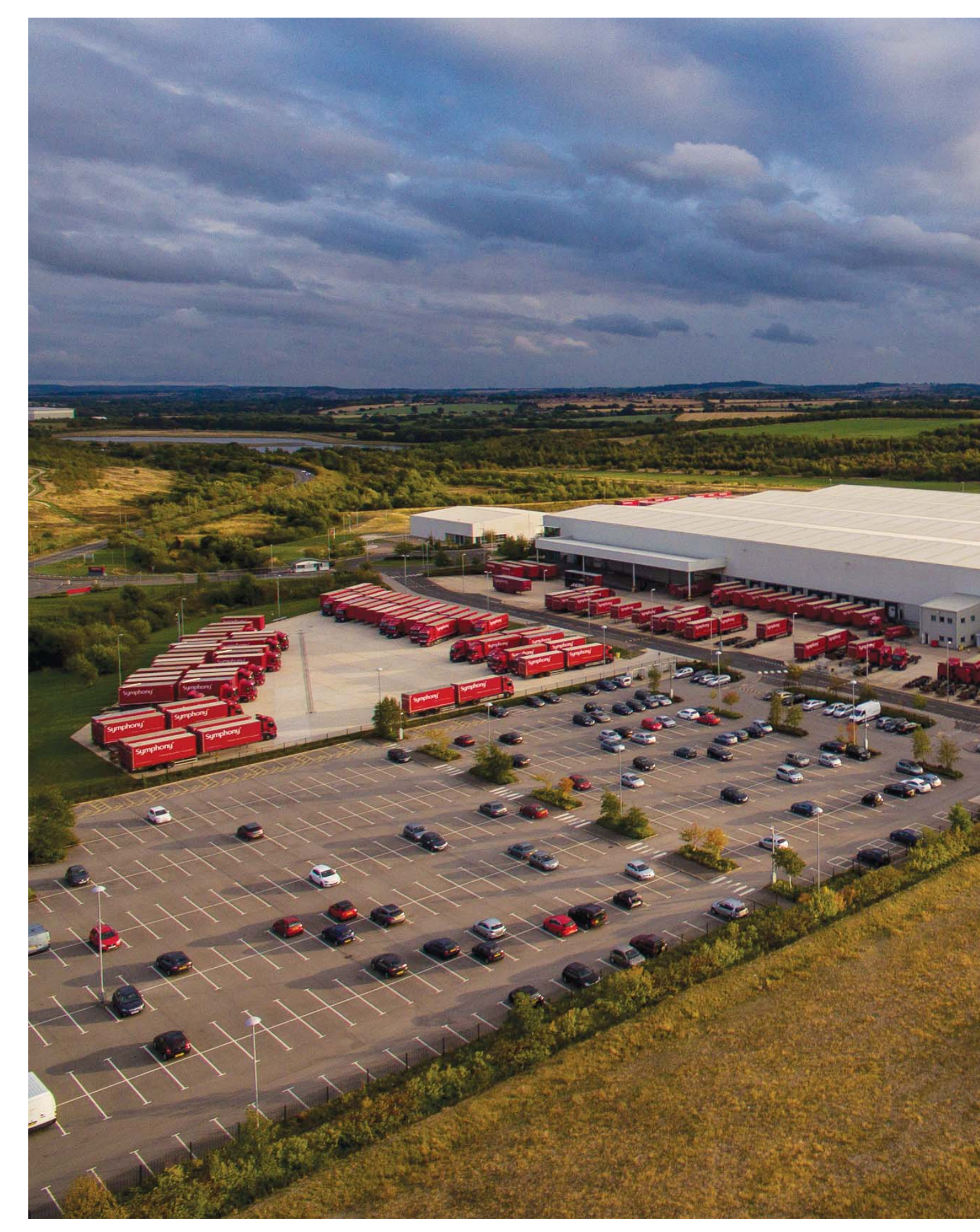
THE SYMPHONY GROUP PLC, BARNSLEY ACQUISITION