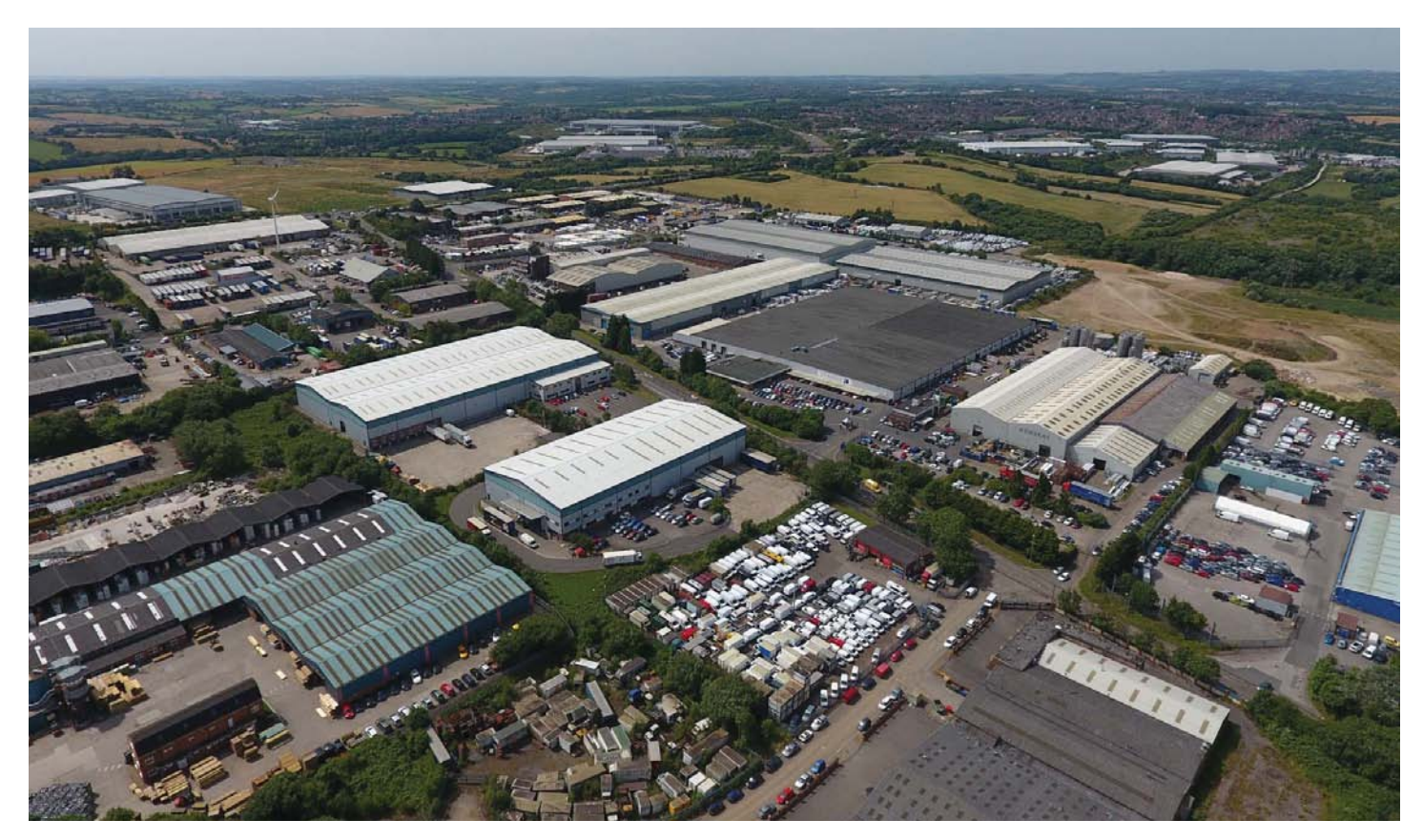
SYNSEAL EXTRUSIONS LTD, COMMON ROAD HUTHWAITE & WHITEMEADOW FURNITURE LTD, EXPORT DRIVE, HUTHWAITE ACQUISITION