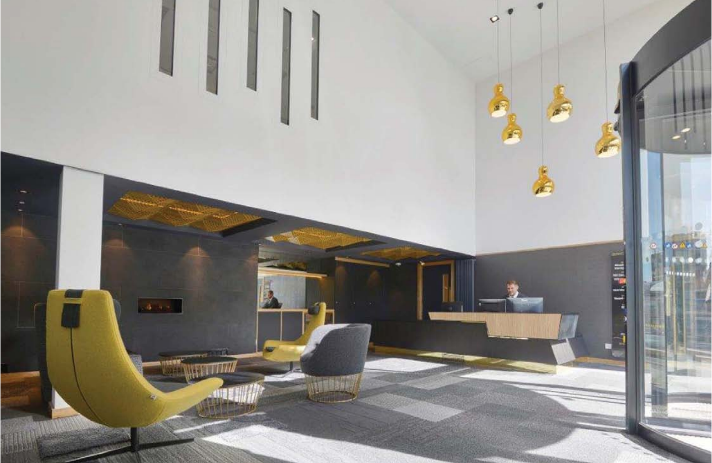
DERWENT HOUSE, SHEFFIELD

Fully Refurbished Grade A Office building in the heart of the City Centre