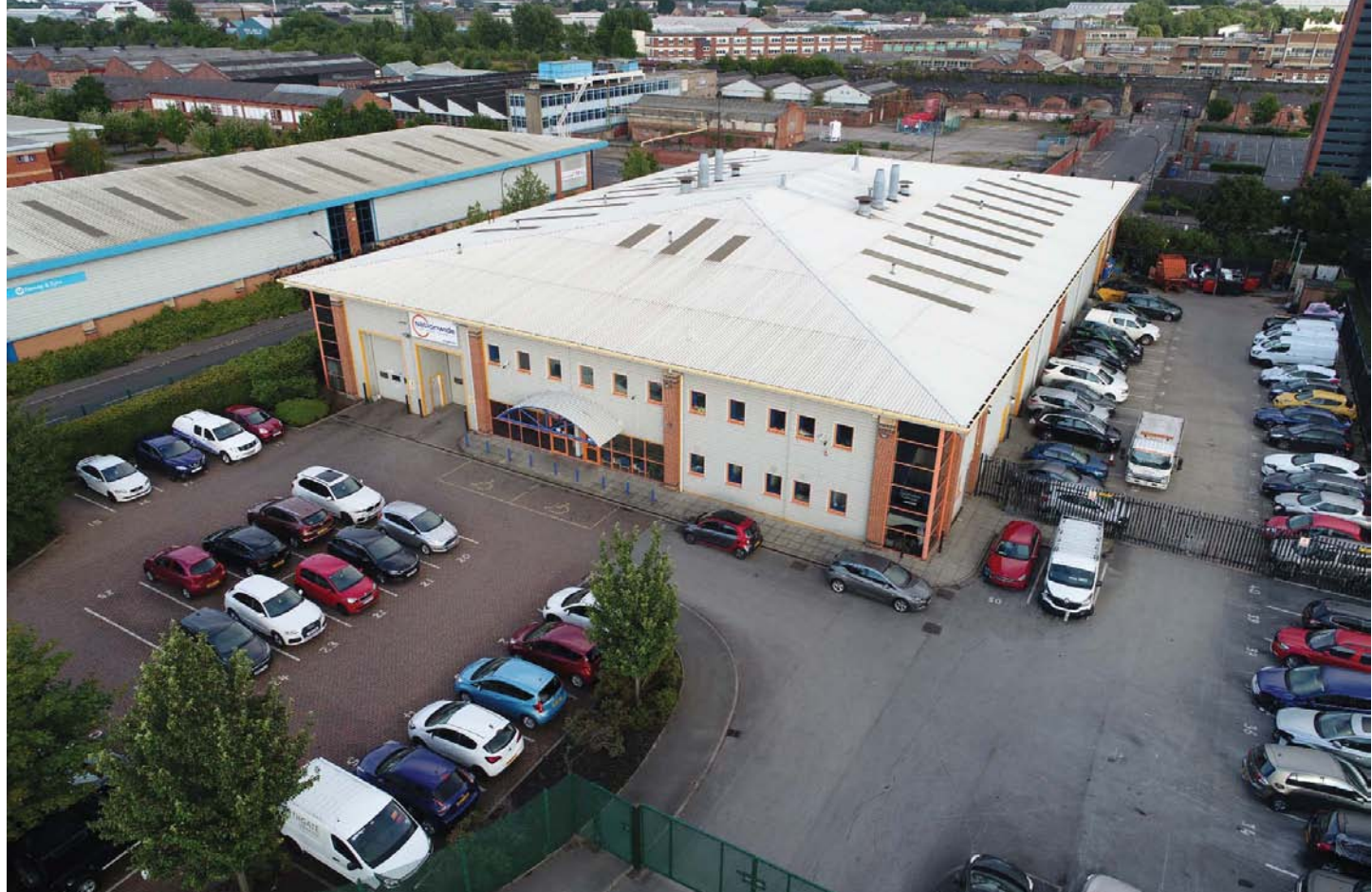
A1 BUSINESS PARK, KNOTTINGLEY & UNIT B PRESIDENTS PARK, SHEFFIELD ACQUISITION