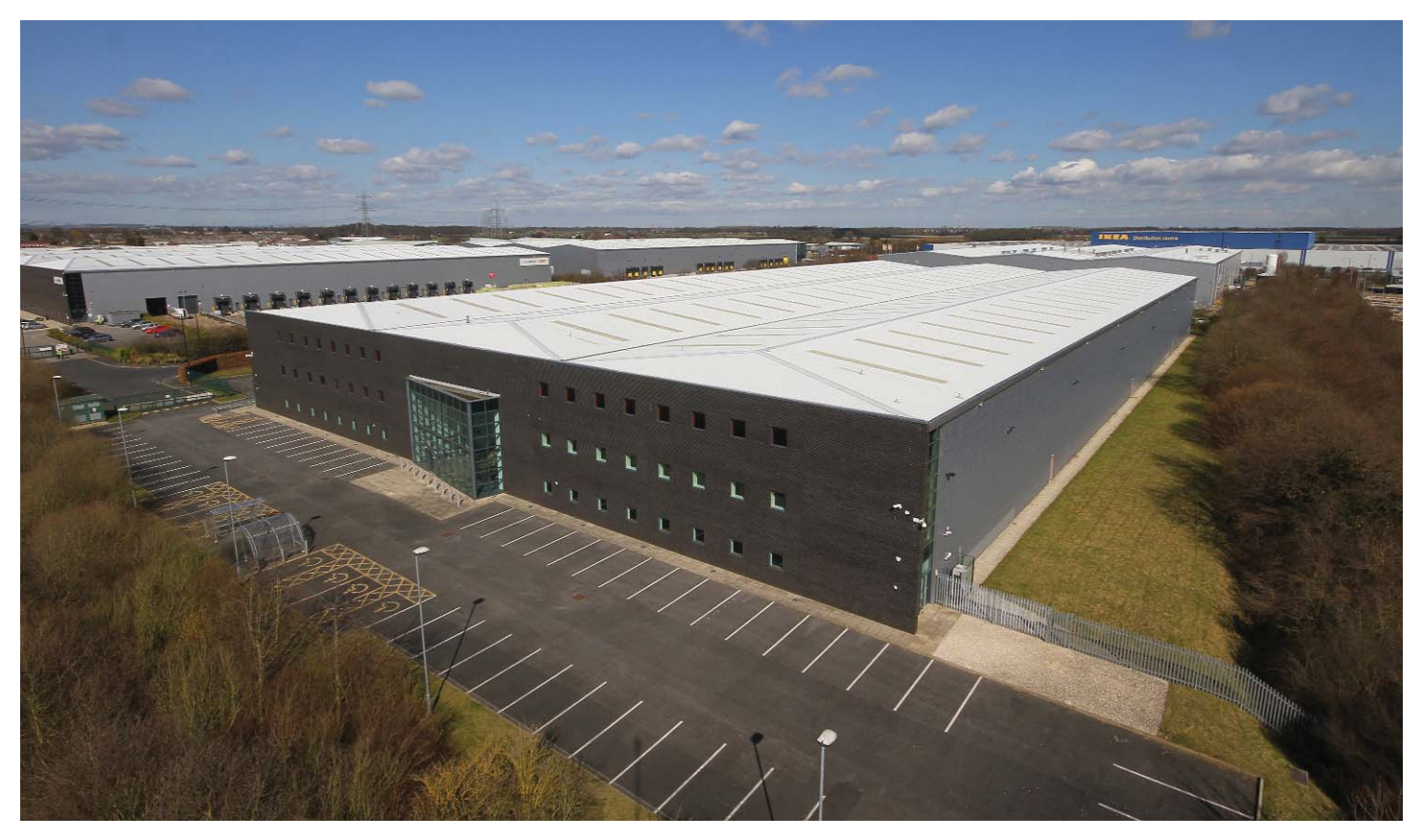
ASPECT, WEST MOOR PARK, DONCASTER

Acting on behalf of Clearbell, CPP successfully leased a logistics unit, totalling 123,000 sq ft to MH Star Ltd.